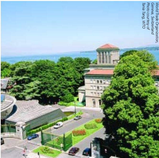
World Trade Organization, Geneva, Switzerland