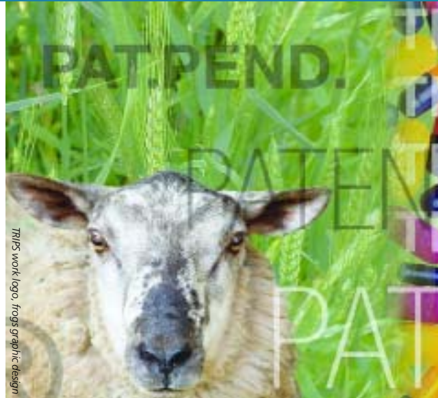
TRIPS work logo, frogs graphic design

Canadian Quakers have expanded their witness for justice and peace at the international level with the launch of the Quaker International Affairs Programme (QIAP) in Ottawa in November 2001.